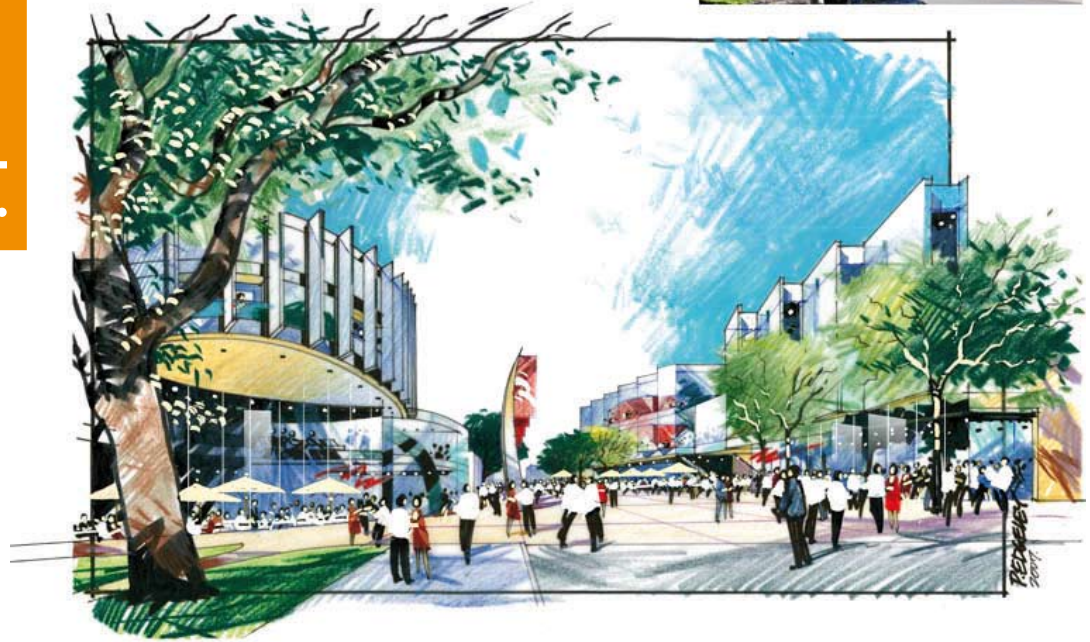
BOULEVARD VIEW LOOKING EASTWARDS ALONG LITTLE MALCOLM STREET